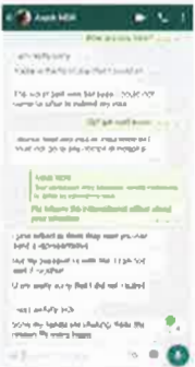
WA 2.jpeg 63K