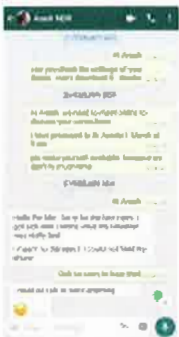
WA 1.jpeg 61K